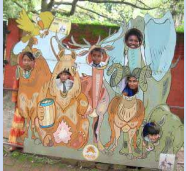
Children having fun at a zoo.