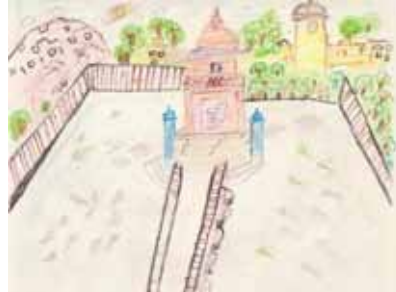
A Temple. (see page 3)

The months of October and November are filled with Joy in Nepal as people indulge in the celebration of two major festivals: Dashain and Tihar. Dashain is the most auspicious festival celebrated by Nepalese throughout the country. People worship Goddess Durga, and also visit relatives, seek blessings from elders and enjoy delicious food.